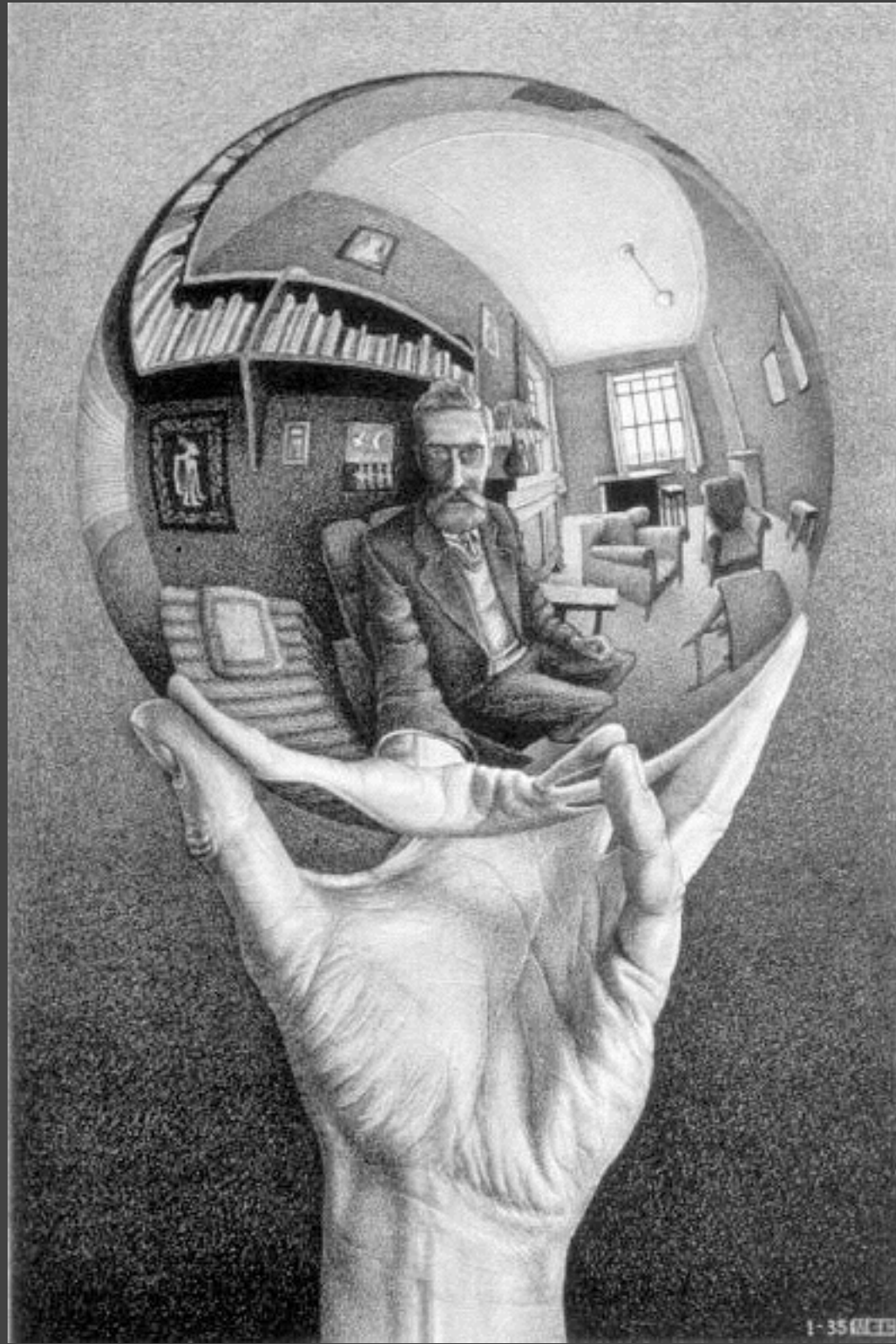
Hand with Reflecting Sphere. M. C. Escher, 1935. lithograph